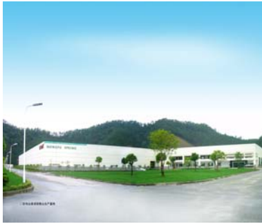
The introduction of JP1/SD desktop management software enhances Nongfu Spring's competitive edge.