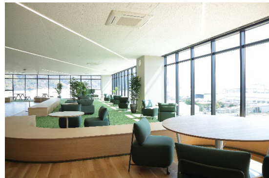
Interior of new production facility