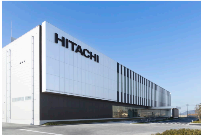
Exterior of new production facility

Tokyo, March 31, 2025 – Hitachi High-Tech Corporation ("Hitachi High-Tech") announced that the new production facility for semiconductor manufacturing equipment (etch systems), which had been under construction since December 2023 in the Kasado area (Kudamatsu City, Yamaguchi Prefecture), was completed and started the operation on March 17, 2025.