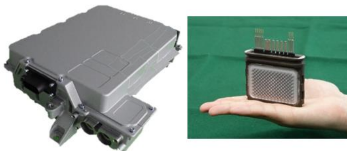
Fig. 1. 800V inverter developed for EVs (left); Double-sided cooled power module (right)

Contributing to the widespread adoption of EVs and realization of carbon-neutral society through innovative technologies that enable greater acceleration and shorter charging times