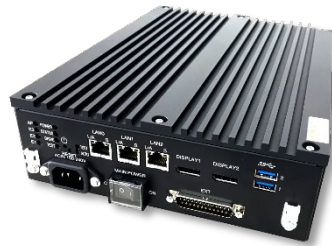
"Hitachi Industrial Edge Computer CE series Embedded AI model"

Contributing to the digital transformation of customers, especially those in the manufacturing industry, through the fusion of Intel's AI technology and Hitachi's highly reliable design and manufacturing technologies