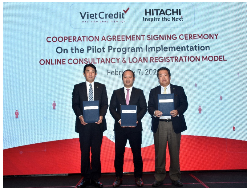
The launch ceremony

Verifying effectiveness to introduce an automatic loan contract service on tablets and a loan screening service using AI