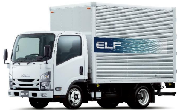
The new Isuzu ELF