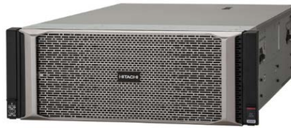
Hitachi highly reliable server RV3000 providing rock-solid foundation for the new solution

Hitachi helps IT system investment optimization and digital business expansion