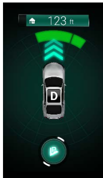
Smartphone screen display during low-speed autonomous driving

* SurroundEye is a registered trademark of Clarion.