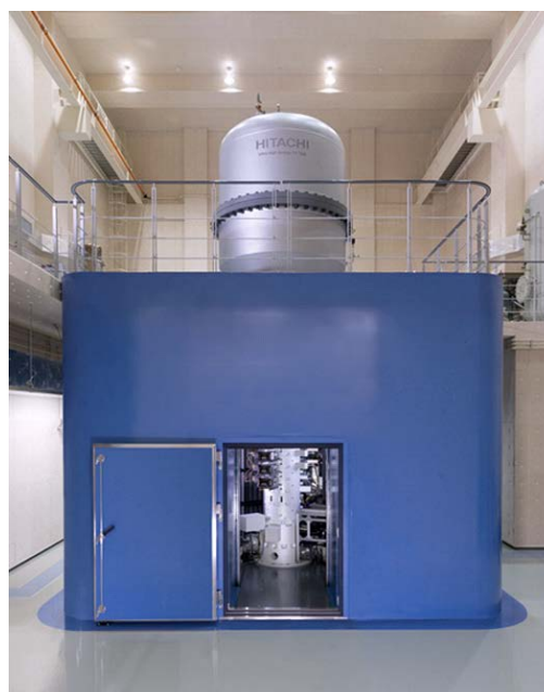
Figure 2. Hitachi's atomic-resolution holography electron microscope

Tokyo, December 6, 2017 --- Hitachi, Ltd. (TSE: 6501, Hitachi) and RIKEN today announced the development of technology to improve observation precision using Hitachi's atomic-resolution holography electron microscope, and the successful observation of magnetic field distributions within magnetic multilayer materials (1) at a world's highest resolution of 0.67nm (2) (Figure 1). This technology enables the observation of the magnitude and direction of magnetic fields that are related to the properties of highly-functional materials, such as permanent magnets, electromagnetic steel sheets, and magnetic thin films, at a level of few atoms at the boundary of the material. Hitachi and RIKEN are looking to contribute to the development of highly functional materials such as high-performance magnets and high-temperature superconducting materials, and progress in fundamental science, by elucidating atomic-scale magnetic phenomena.