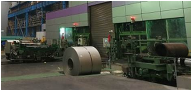
Cold Rolling Plant

Digitalizing the operational know-how of skilled workers to contribute to improvements in operability and quality