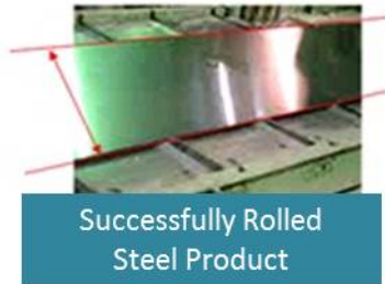
Successfully Rolled Steel Product