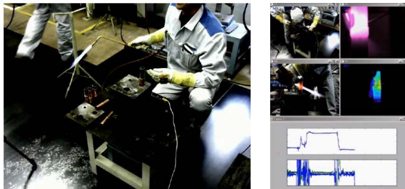
Example of brazing work and brazing process sensing, utilizing advanced image analysis

Digitalizing the Manufacturing Workplace Know-How Using Advanced Image Analysis and Other Technologies