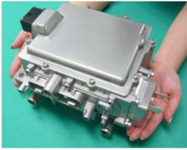
Fig. 1: Developed inverter