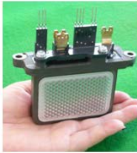
Fig. 2: Double-sided-cooling full-SiC power module