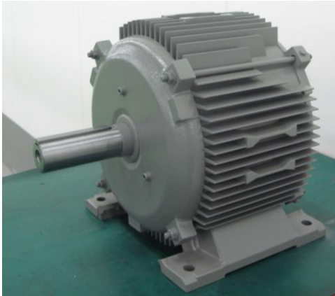
Fig. 1. IE5-class 11kw prototype motor