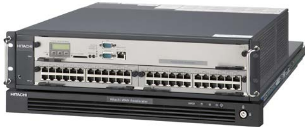
Hitachi WAN Accelerator Remote Backup Model

- Approximately 26 Times Faster Remote Backup of Large-Volume Data Between Data Centers -