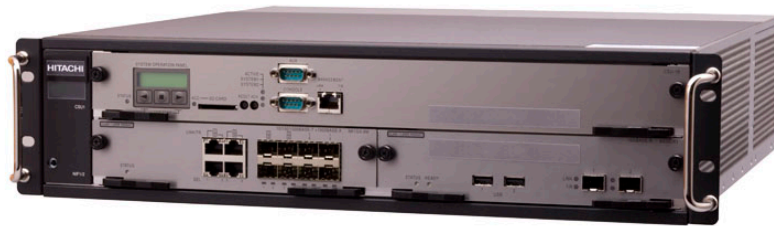
A Hitachi WAN Accelerator

-- 15 times faster than conventional TCP/IP in United States-Japan file-transfer experiment --