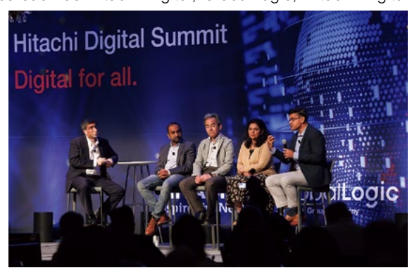
Leaders from the digital and OT sectors came together to discuss the latest technology and efforts \,

Services, and Hitachi Vantara, as well as OT sector companies such as Hitachi Energy and Hitachi Rail, have begun to participate in each other's Board of Directors. In addition, we are accelerating the exchange of business practitioner talent between the OT sector and Hitachi Digital with the aim of establishing a cross-sector digital strategy formulation and execution system.