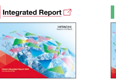
Readership Institutional investors and other stakeholders

In particular, the Integrated Report and the Sustainability Report, which are released on the same day, can be read together to confirm ESG initiative progress and data in addition to management strategies. We also invite you to visit our websites for additional information.